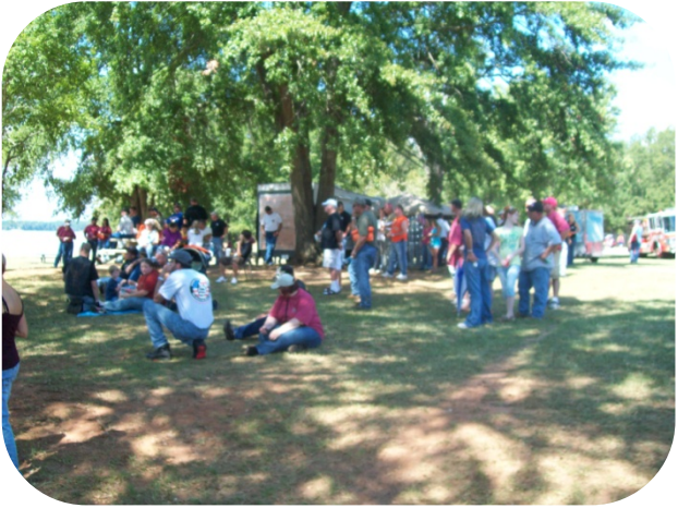
It was a beautiful day at the Park!