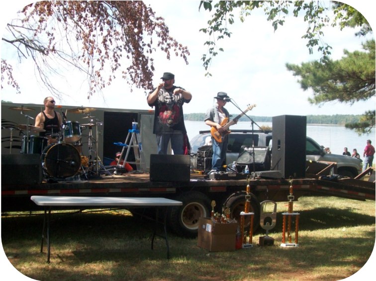
Terrific Southern Rock Band – "HIRED GUNS"!