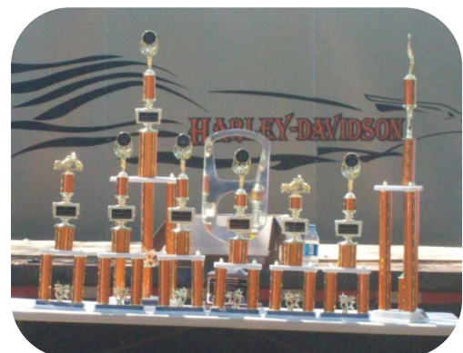
Trophies are presented to the winners in three categories!